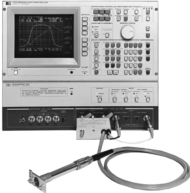
HP 4194A with HP 41941A